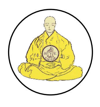
Lau Gar Trust